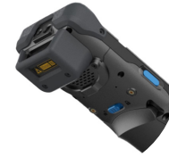
Long range version EX30 Near-Far imager 20m reading distance*.