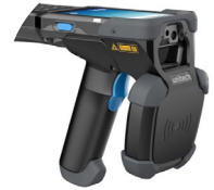
UHF/RIFD version with 2D imager.