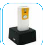
*MOQ only* Charging cradle*

*Contact Unitech Europe for more minimal order quantities (MOQ) details.