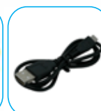
1550-900104G Micro USB to USB cable