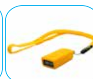
3210-900019G Protective Case (anti-microbial)