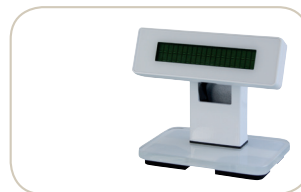
4. Optional VFD stand alone customer display