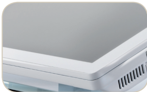
1. Bezel-free touch