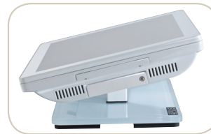
2. Standard configuration with unique EyeSTAND POS in metal glass construction