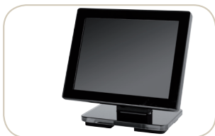
3. Optional 8.4" stand alone customer display