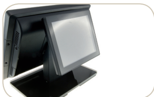
5. Optional 8.4" rear mount customer display